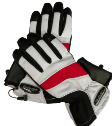
Women's SnowStorm Ski/Outdoor Gloves