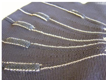
ThermoKnitt™ Liner (Uncut)