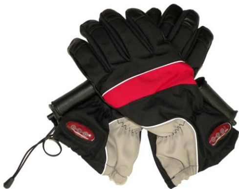
Men's SnowStorm Ski/Outdoor Gloves

The unique ThermoKnitt™ Heat Technology by EXO2 provides the world's first self-regulating heated glove system. No external controller is required as the material will heat to the pre-set temperature of approximately 110°F. Continuous use of 3 hours is available on a single charge of your EXO2 miniature Power Packs.