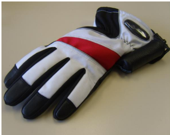
Ladies SnowStorm Ski Gloves

Our unique ThermoKnitt™ heating technology provides the world's first self-regulating heated glove system. No external controller is required as the material will heat to the pre-set temperature of approximately 110°F. Continuous use of 3 hours is available on a single charge of your exo 2 miniature Power Packs.