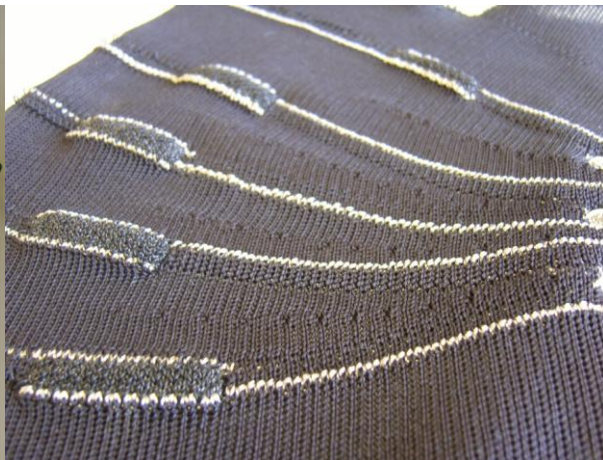
ThermoKnitt™ Liner (Uncut)